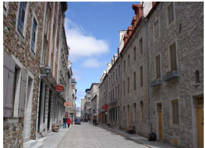
View of Lower Town

He has practiced as an independent heritage consultant, a Preservation Officer and Planner with the City of Toronto; he is a former Board member of the Canadian Association of Heritage Professionals (CAHP), and a Director of the Association for Preservation Technology International.