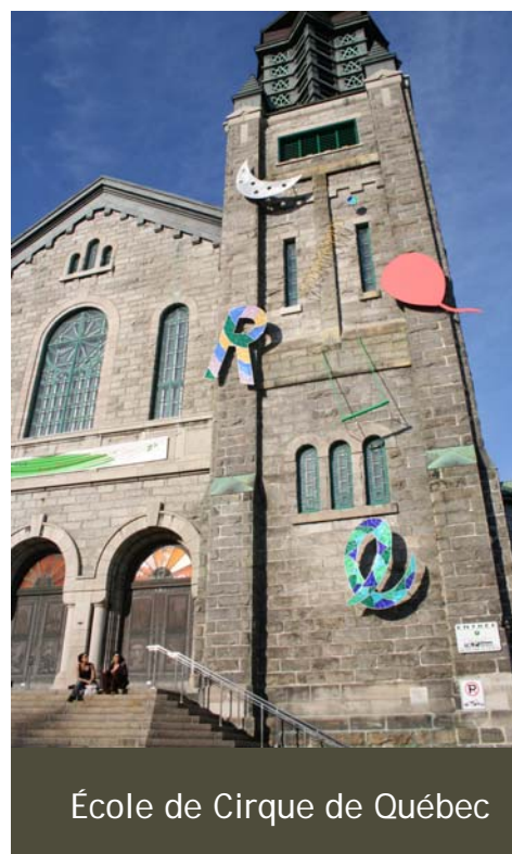
École de Cirque de Québec